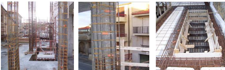
Application of GSC SuperAnode on new structures

This allows a relatively small amount of anodes to be distributed within the structure thereby reducing manpower requirements and costs if desired, performance can be monitored easily by on-site personnel